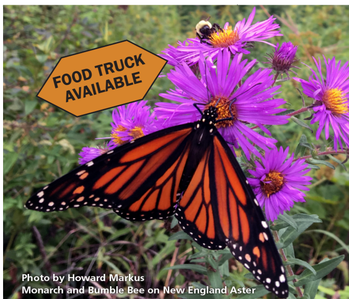
Monarch and Bumble Bee on New England Aster